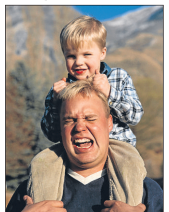
I love you, Daddy — as I pull your hair out . . .