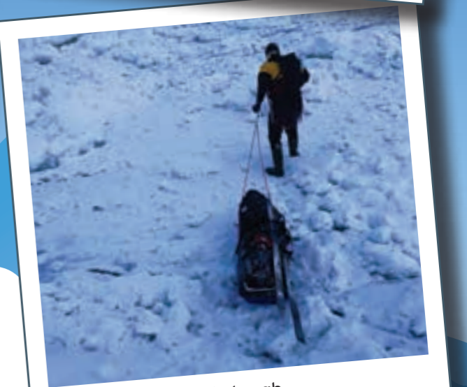
When the going gets tough...