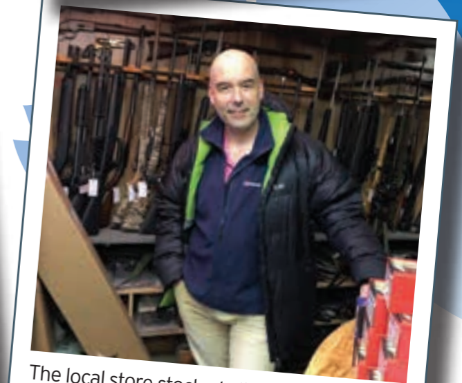
The local store stocked all the essentials