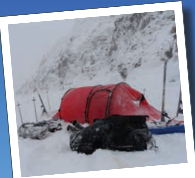
Home sweet home

"We will do another full kit test before heading out but most likely this will be in Scandinavia. The most likely timing for this will be end of January 2016. Roll on next March for the expedition."