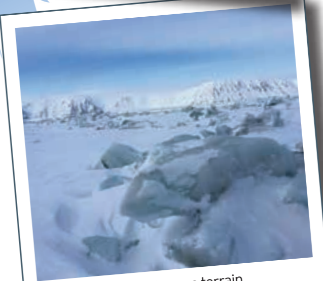
Beautiful but treacherous terrain